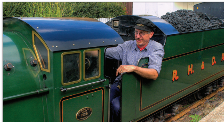
Right: St Mary's Bay