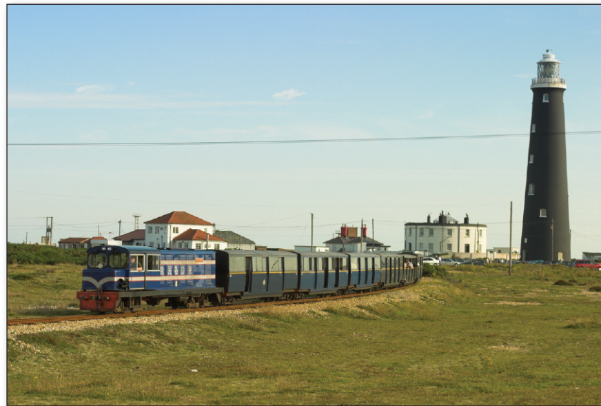
The old lighthouse at Dungeness