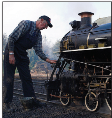
No.10 Doctor Syn