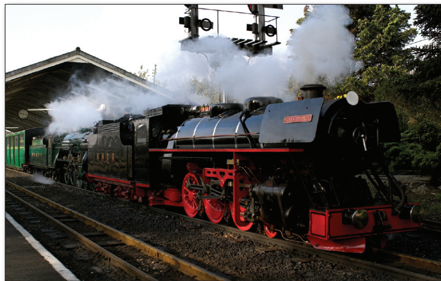
No.11 Black Prince